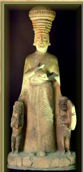
The worship of Cybele was originally centered in Phrygia (central Turkey), where she was known Kubaba or Kybele. The Romans formally adopted her worship in 204 BCE, when they brought a statue representing her from her main shrine in the Phrygian city of Perganum back to Rome. This statue, from a site in Anatolia dating to the eighth or early seventh century BCE, depicts the Phrygian goddess with two youthful attendants playing a flute and harp.