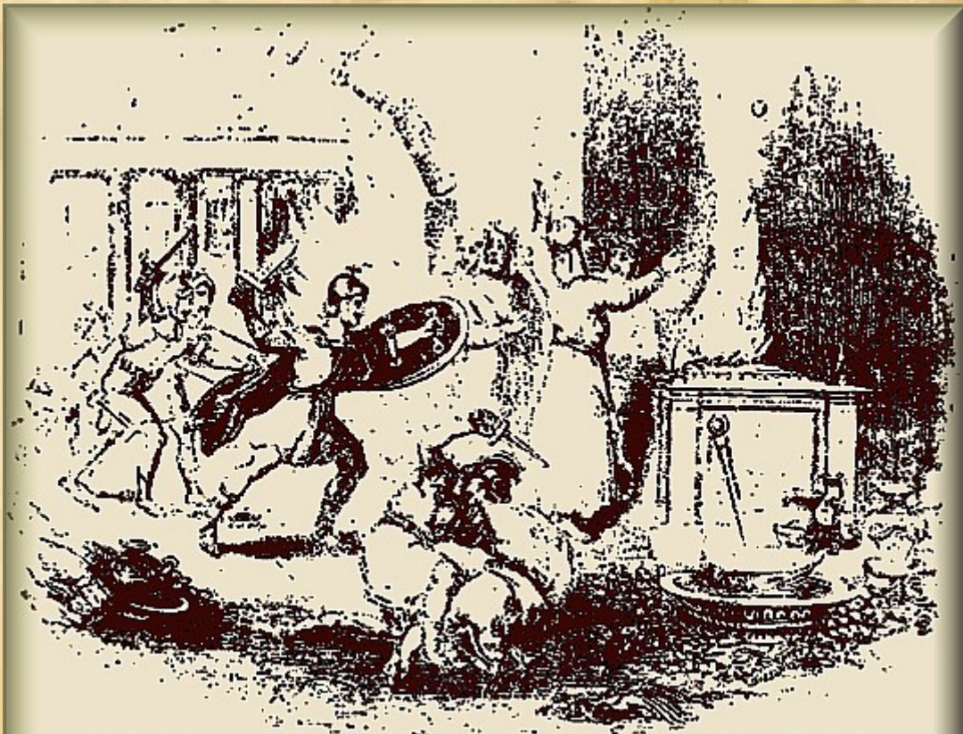
THE LEGIONAIRES OF PISO AND TITUS STORMING THE TEMPLE