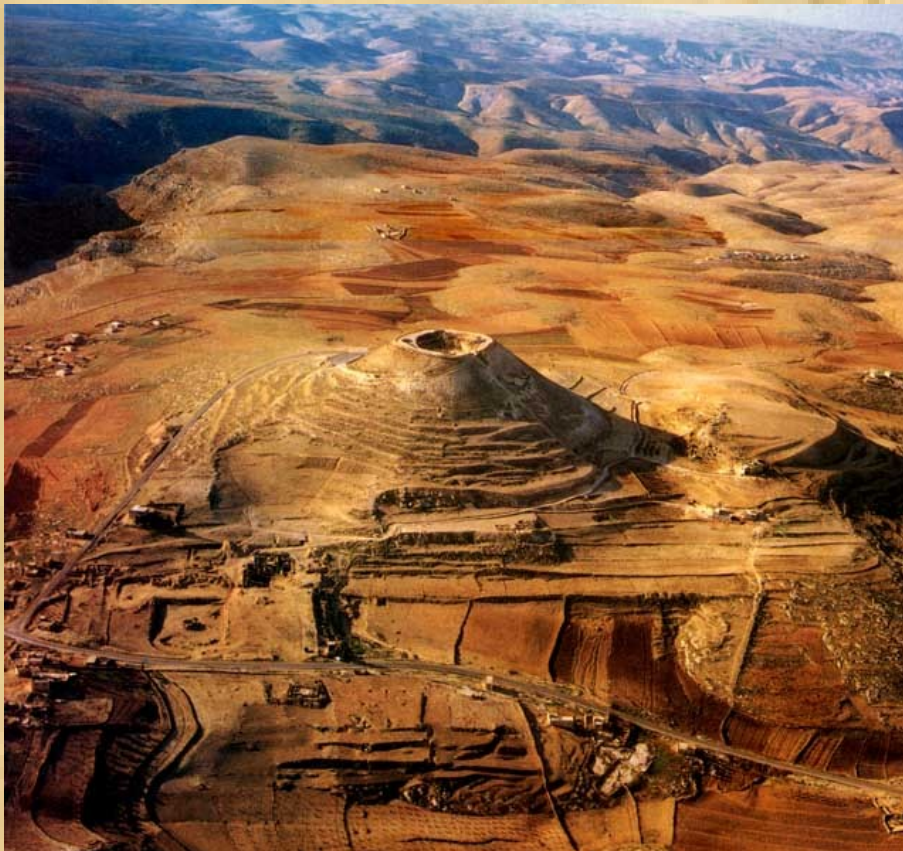
The Burial Place of Herod the Great Herod's Desert Fortification - The Herodium

Julius must have thought his being married to Hadrian's sister (in which capacity Roman history knows him as Julius Servianus) 10 would protect him. But they took him to Rome and executed him 11 . In his fictional identity as the disciple John, Julius would be the only NT disciple not martyred--because Julius was the only son in fact martyred for opposition to the great creation!