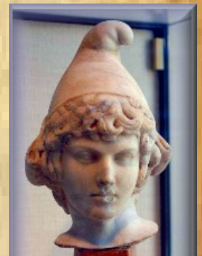
Attis, the Phrygian shepherd, whose worship became part of the cult of Cybele. In varying mythological accounts, Attis is killed or is driven insane and castrates himself, as the result of jealousy and passions arising from an ill-fated love affair. Attis' fate served as the model for the galli priests, who underwent castration to become Cybele's dedicated and chaste servants.